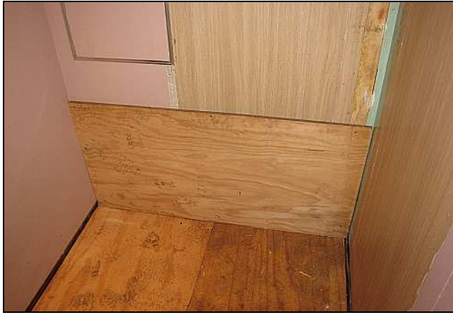
S13 – Panelling also started on the splash wall. This area, as well as the ‘woody’ laminate on the right side, is to be tiled with 150mm tiles. The tiles will be attached with silicone-based adhesive for some flexibility on a moving coach. The laminates will first be scarified with a coarse flapper wheel to enhance the grip of the adhesive.