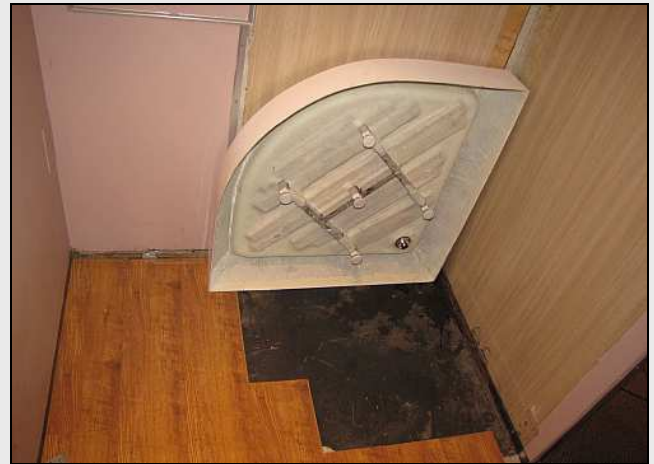
S04 – This view shows how the floor planks proceed under the shower base, which has adjustable feet. We need to exaggerate the drain-fall slightly as sometimes the coaches stand unevenly and the showers form foot wash basins.