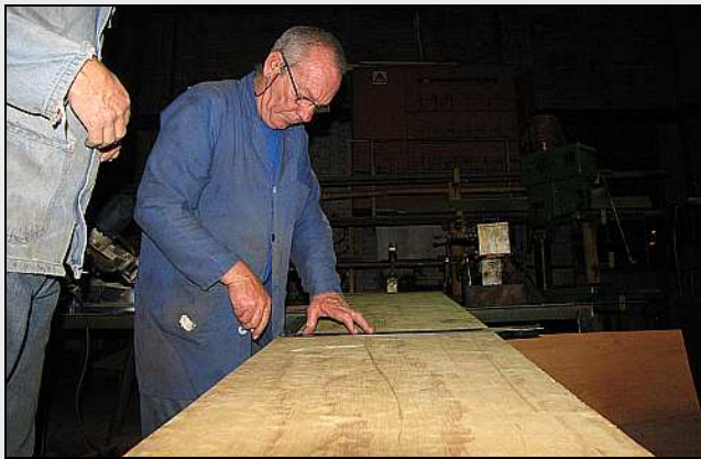
S15 – The day’s beer tasting train had come and gone (The repaired 12AR went like a champ!), the loco crews and train staff gone home and the 15M workshop schmucks still working on into the night! Here Gordon is marking out what is to become the top splash panel for Comp C’s shower.