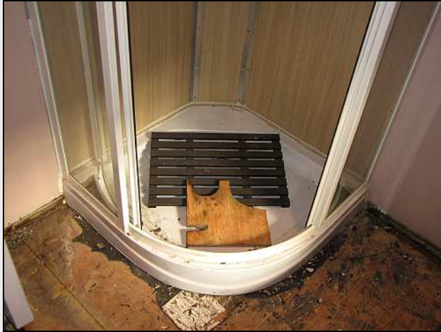
S01 – One of the 'Setimela Showers' shows the weak design. The moulded shower base is circular in outline with the straight side wings poorly braced. They were flexible and tended to leak at the walls and the floor where they had been accidentally kicked. (Breaking the silicone beads.)