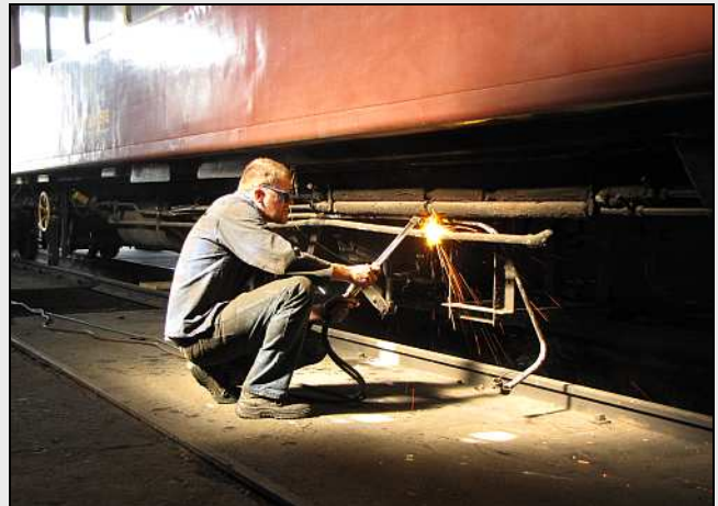
U04 – The Smudge-Meister cutting away some lighter stuff from the coach underbody. (The insulated steam heating line is already gone.) The torch is starting its way through the cold water line for the original under-slung geyser.