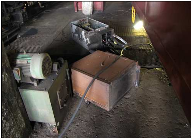
U03 – Some of the obsolete equipment that had been cut away from the coach – no sense in burning good coal to haul this dead stuff around. The green machine to the left is the hydraulic pump-pack for the loco wheel lift jacks.