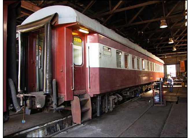
U02 – Gold Class Coach No.23189 in all her Gulf Red and Quaker Grey glory. If this coach's compartments sell well on the steam tours, there is an unused coach in our yard that would be ideal for conversion to a 2 nd Gold Class unit.