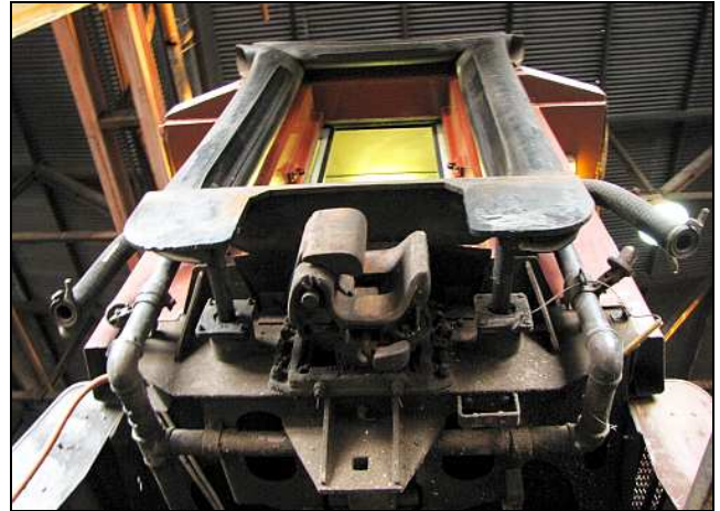
X02 - Looking up at the illuminated gangway above the buffer plates and draft gear. All this hardware (and the bogies) will need to be serviced before the train runs. Time to purchase shares in graphite grease, methinks.