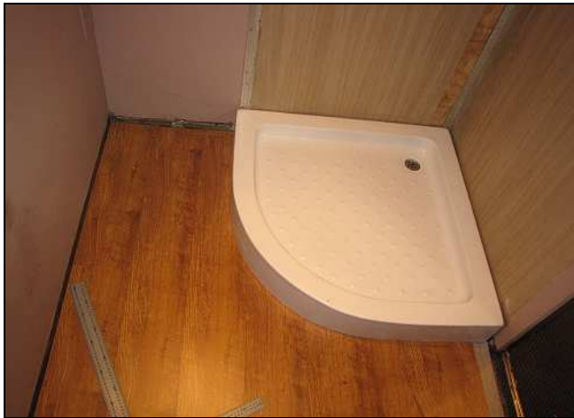
S03 – One of the new shower pans being tested for fit. Mr. Maurer chose a rigid straight-wall design with a deeper base. The shower walls are going to be tiled with the shower base skirts being 'siliconed-in' as well as beaded.