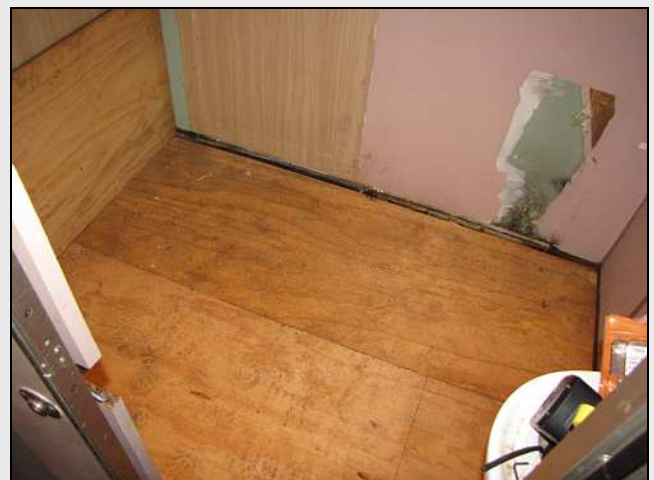
S12 – The poor quality floor had the holes patched in and then was sheeted over with 7-Ply wood sheets. The piping holes are covered up as well, but they will be re-drilled by using pilot holes up from underneath the coach.