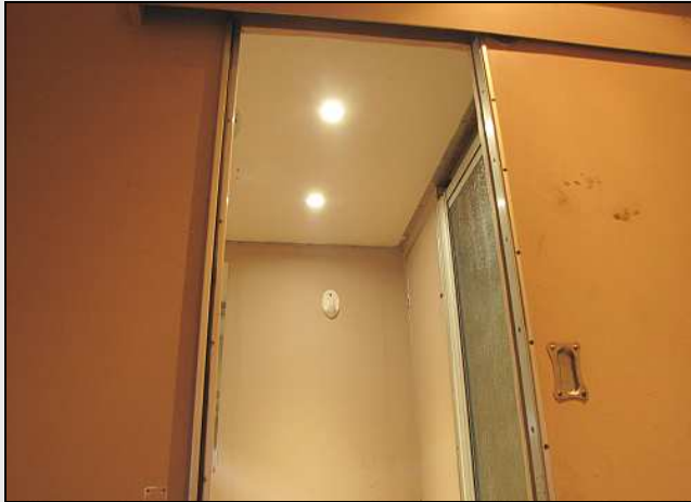
X01 - Gold Class A's shower was fitted with LED type down-lighters during the week. The ceiling is so low that the more conventional halogen down-lighters were heating up people's craniums and certain hairless domes.