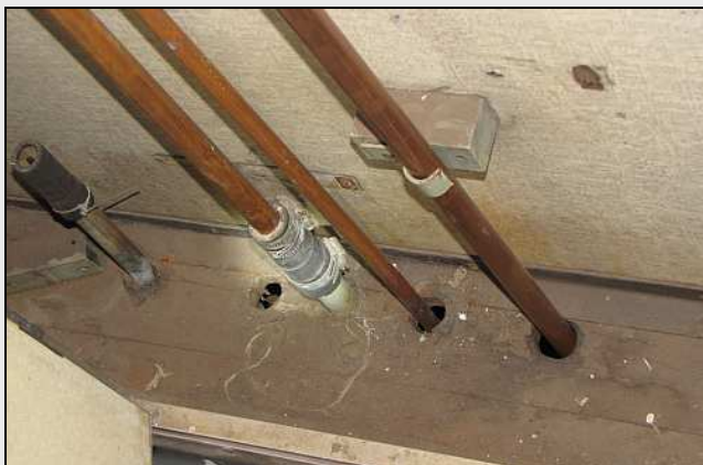
X05 - Another little glitch - a rubber coupling on a riser pipe. It is the cold water line for the geyser, so it isn't so bad, but it will be replaced with a modified bushing.