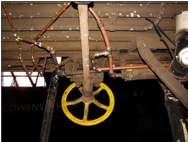
X03 - Some of the crazy plumbing visible above the handbrake. It is a mixture of copper and synthetic. We are gradually converting to the synthetic as it has no scrap metal scrap value (theft) and it is able to withstand sub-zero temps. Because it is semi-flexible, it reduces the number of fittings. Unfortunately, it does perish with hot water, but the duty cycle is so low it will serve for years with no problems.