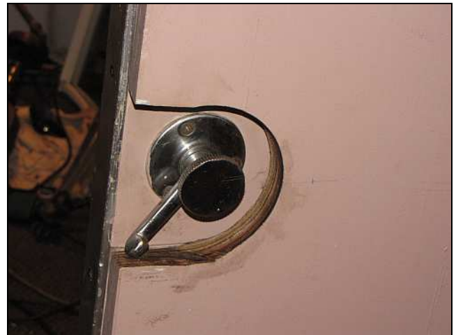
S10 – After a time-wasting battle to remove a door handle in another compartment, this one was simply let into the door panels to allow an extra few inches of opening. The handles and bed bunks were blocking the relocated doors.