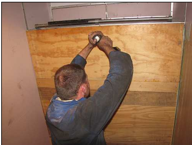
S21 – Dr. Smudge tries out the battery-powered screw driver and was quite impressed! (It's a very high-tech tool for a man who uses hammers and slogging spanners on the locomotives.)

The top of the panel will be capped with a silicone-backed aluminium angle when the tiles are done.