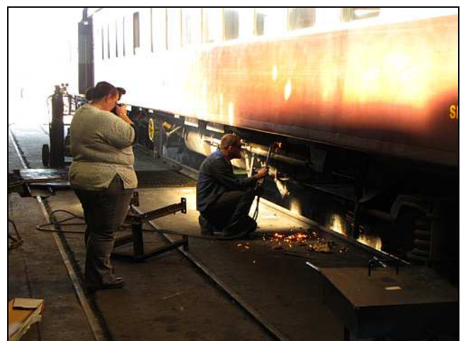
U06 – The Sanderson was present too, so there was no escape from the cameras this day. The underbody clearing is also to facilitate later installation of cess-tanks and additional water tanks for later upgrades.