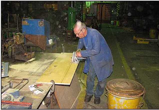
S19 – The fellows were tired and debating about whether to bother cutting a narrow board to fit to finish off the job. They decided to do the job properly. The light specks in the photo are sawdust motes!