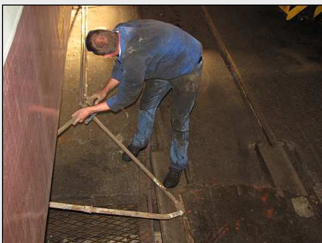
U05 – Now a whole mess of piping had to be pulled out. This is the old geyser plumbing. We do have a coach using the original geyser but this coach already has a 100 litre unit fitted inside – so the existing unit is in for the chop.