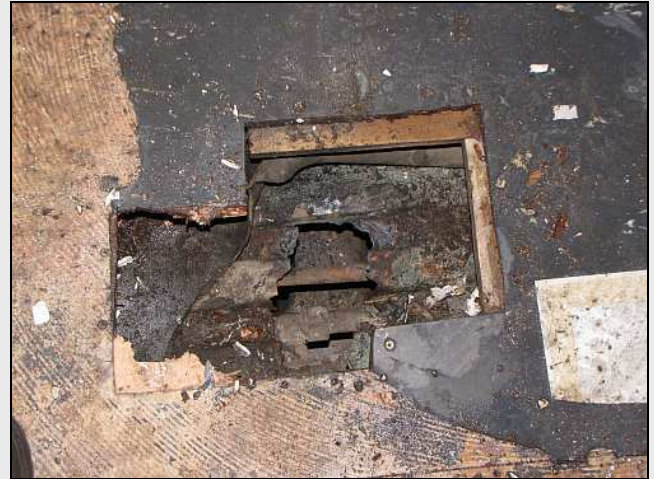
S08 – This roughly cut hole shows the complex floor construction. First the vinyl, then the laminated marine ply floor boards, then the steel backing, then the joist space and then the under-floor covering. The visible pipes are out-of-service parts of the original plumbing system.