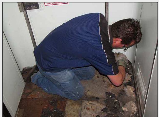
F02 – Over the years of the doors being left partially open, many of our coaches now have rotted flooring. The aged vinyl later cracks in the weather extremes. A domestic vinyl sheet had been laid over this aged floor, without skirting or sealing, so the water was still able to penetrate the timbers.