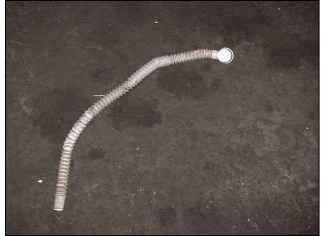
S02 – The old showers also used cheap concertina drain pipes. The ridges impede the drainage and trap the hair and dirt. The pipes also contracted in service, shifting the outlets. The pipes, designed for side exit, were bent 90 degrees just beyond the head, collapsing the waterway.