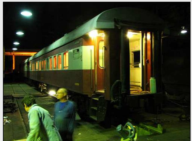
S22 – Coach work continuing on into the Saturday night. As we are in winter season it gets dark at 6:15pm, so it wasn't actually that late.

The top of the panel will be capped with a silicone-backed aluminium angle when the tiles are done.