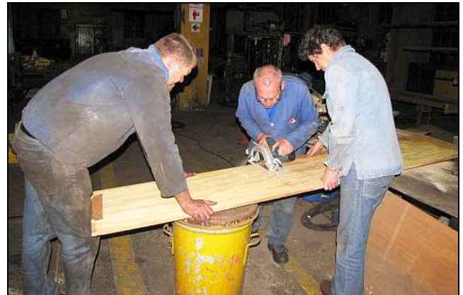
S16 – When doing sheet work, the lack of clear workbench-space became a problem. The fellows are cutting out the final full-sized splash board while being very careful of that blade. The day staff will be tasked with clearing that bench during the week. (The S.Ack. Anti-Sukkelaar policy.)