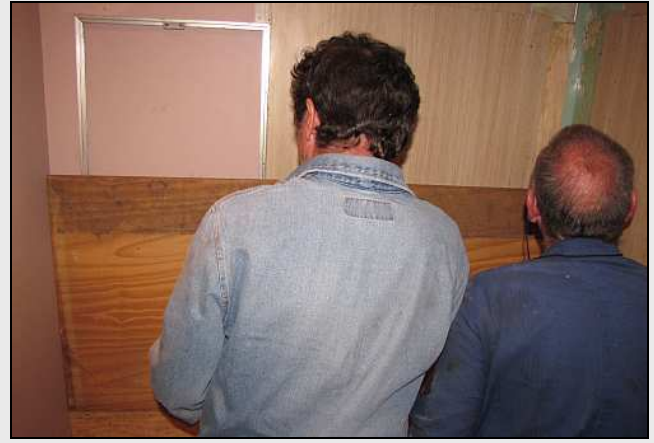
S14 – The center splash board goes in. The laminated area in front of the chaps is where the coupe’s compartment’s door was. The panels will go straight over the sliding window hatch. (This hatch was still functional in the original installation!) The hatches will be either plated in or covered with pwettie-pics on the corridor side.